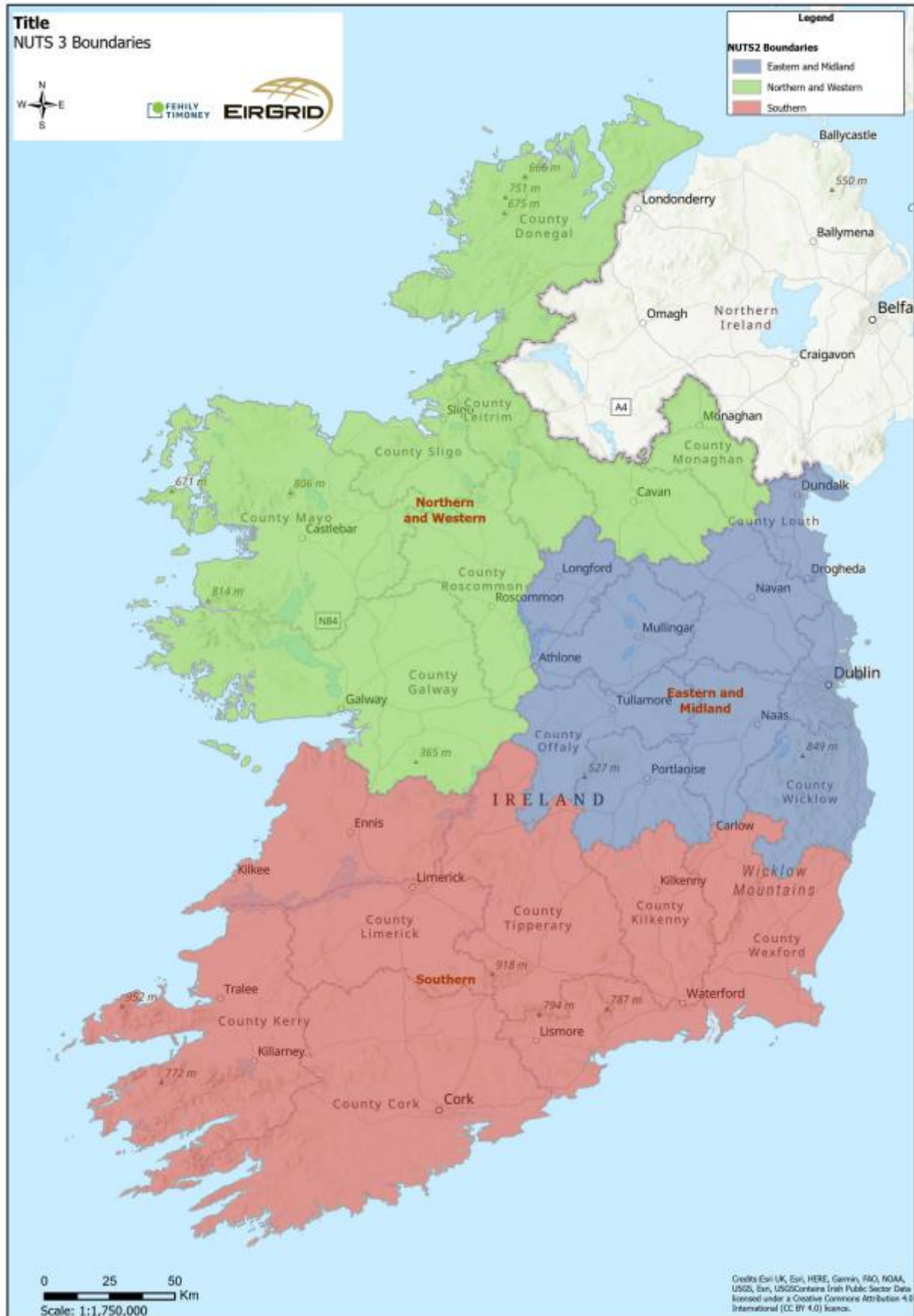
Figure 2-1: NUTS 2 Planning Areas