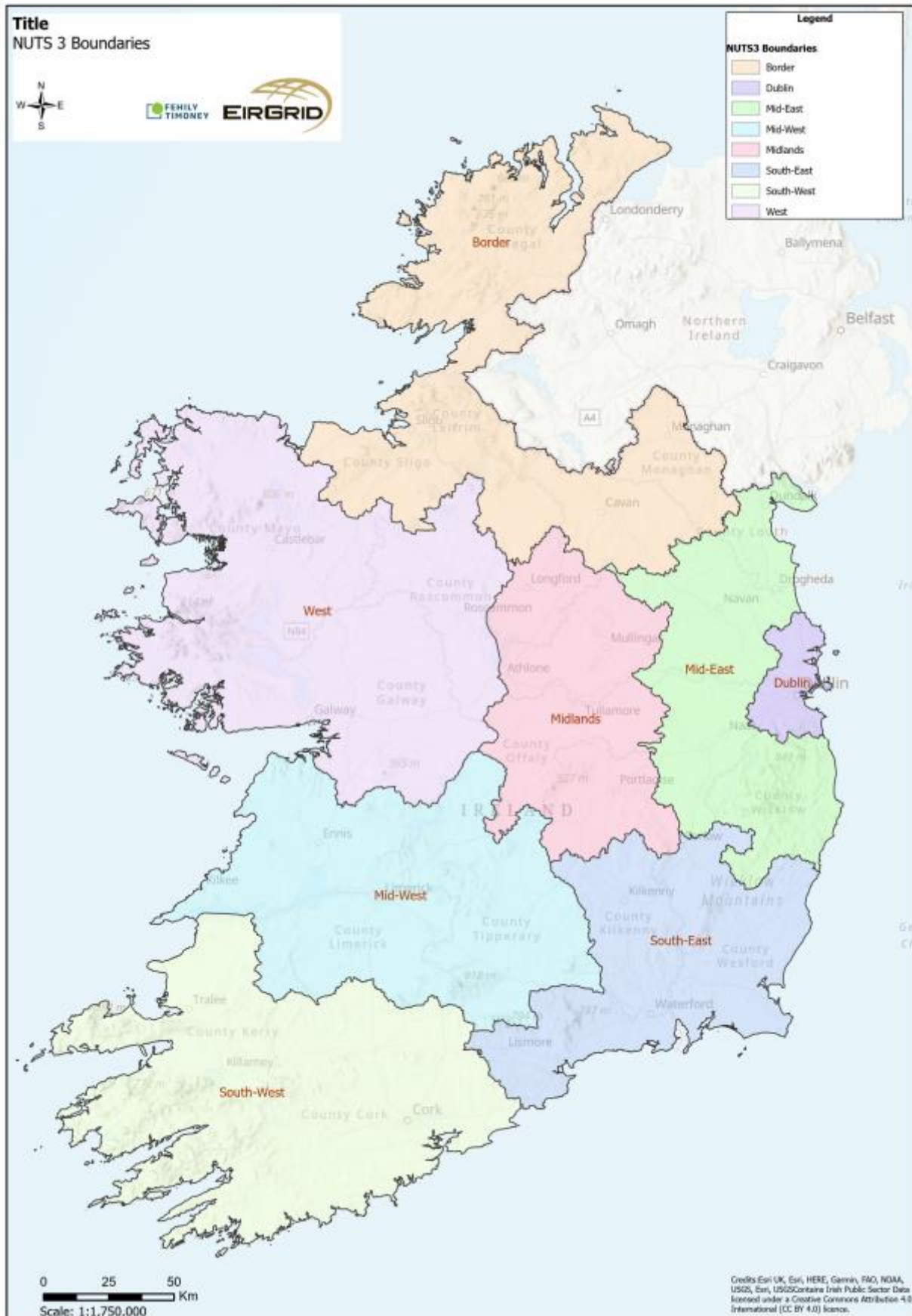
Figure 2-2: NUTS 3 Planning Areas